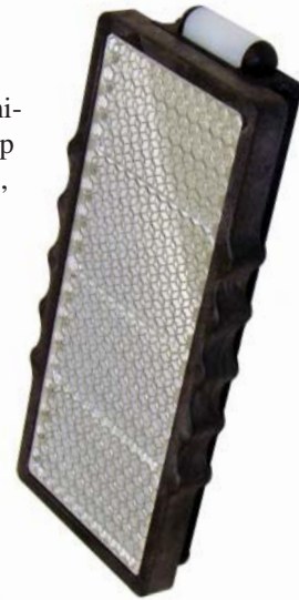
Model 215 Alpha Frisker

• Model 215 Calibration Software (Part No.: 1370-080) available to assist in changing parameters and determining operational settings.