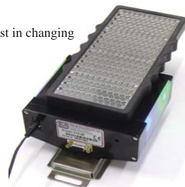
Model 215 shown with Model 215-20 Charging/Calibration Stand